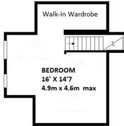
1ST FLOOR APPROX. FLOOR AREA 309 SQ.FT. (28.7 SQ.M.)

TOTAL APPROX. FLOOR AREA 973 SQ.FT. (90.4 SQ.M.)